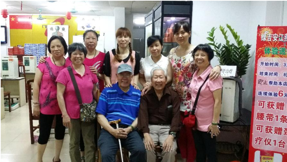
Then a nice meal with Sing's family.