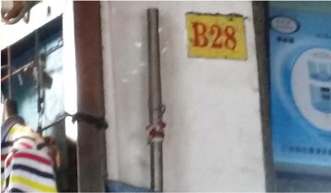
Goodbye lunch wing Xing's family.